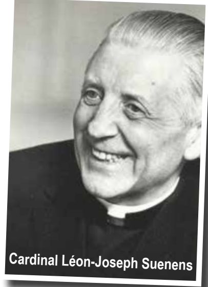
Cardinal Léon-Joseph Suenens

An international study group promoted by Cardinal Léon-Joseph Suenens, Archbishop of Malines-Brussels and Primate of Belgium, with input from some of the most expert theologians – René Laurentin, Michael